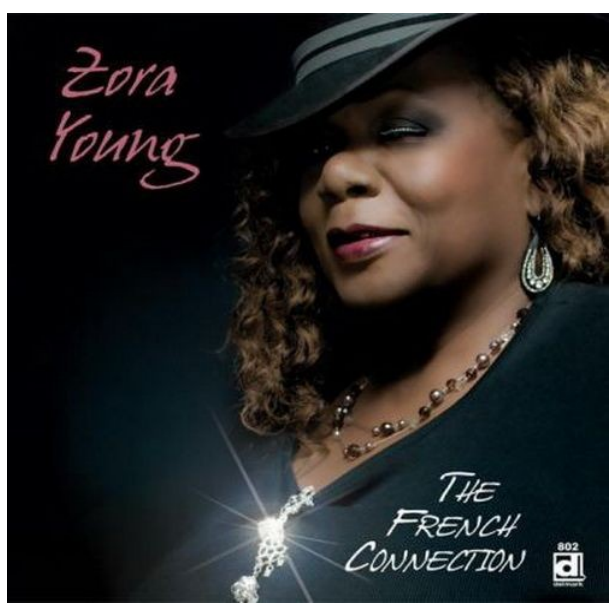
The French Connection (2009)